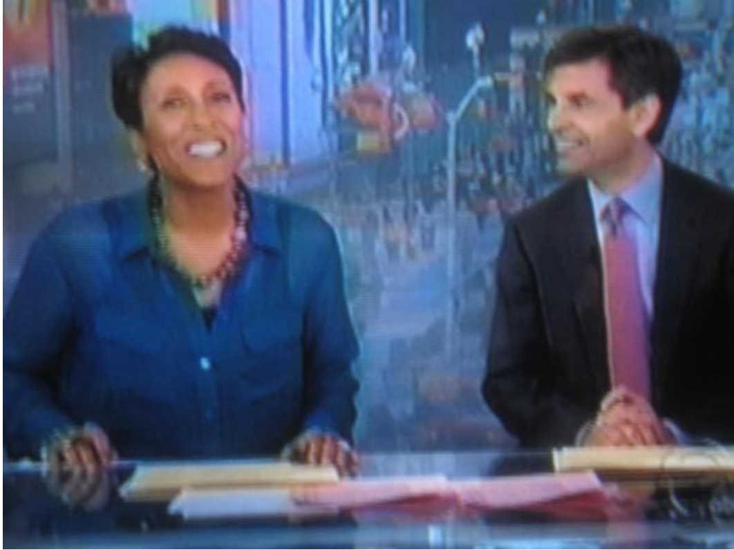
Anne Curry on NBC: